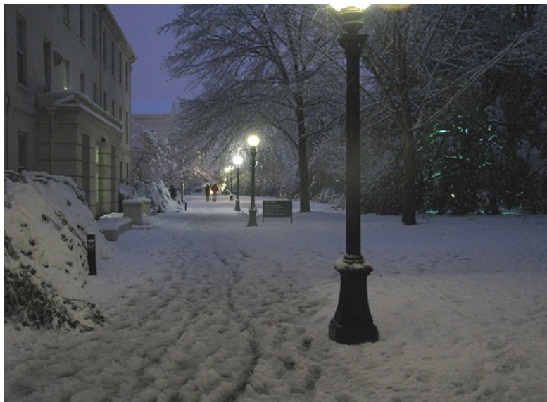
January's snowstorm, while rare and beautiful, shut down the campus and surrounding community for nearly a week.

"Many people incorrectly believe their vehicle can handle driving on ice," says Walls, "but under icy conditions, most vehicles fail to maintain traction with the road, which results in accidents and stranded vehicles. Even if the roads are passable, the potential still exists for patches of ice in parking lots and walkways and may require additional caution."