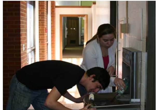
The new water bottle refilling stations are a crowd favorite in the Ecology Building. A popular feature is the digital counter, which indicates how many disposable plastic bottles have been diverted from the waste stream.

Want to learn more? Contact the UGA Office of Sustainability .