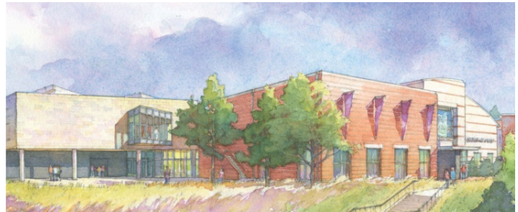
Artist's rendering of the new Georgia Museum of Art

Designed by Gluckman Mayner Architects of New York with collaboration from Stanley Beaman & Sears Architects of Atlanta, the